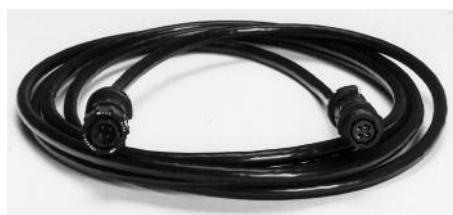
10' Extension Cord with CPC connectors, A29505