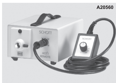
115 Volt ACE® Remote Light Source with EKE lamp, A20560