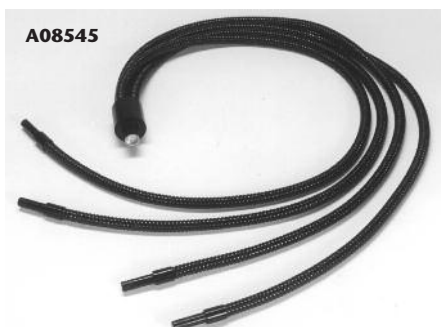
Quad Bundle, A08545