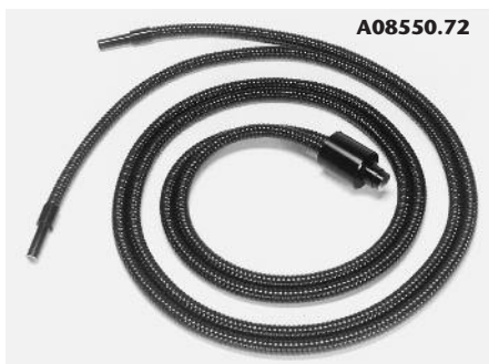
Dual Bundle, A08550.72