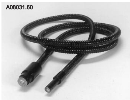
Single Bundle, A08031.60